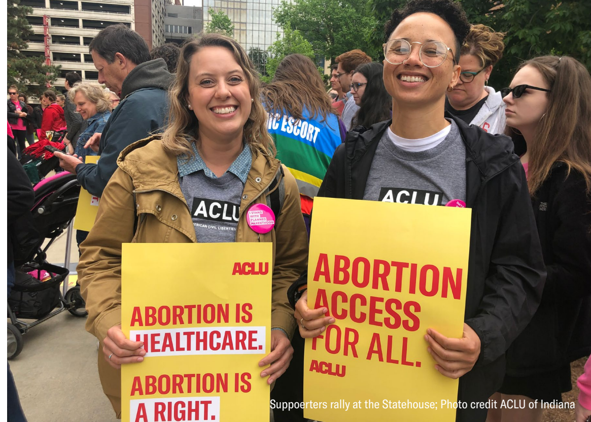
Supporters rally at the Statehouse; Photo credit ACLU of Indiana

After the Indiana legislature passed the bill, the ACLU of Indiana immediately filed a lawsuit and the U.S. District Court for Southern