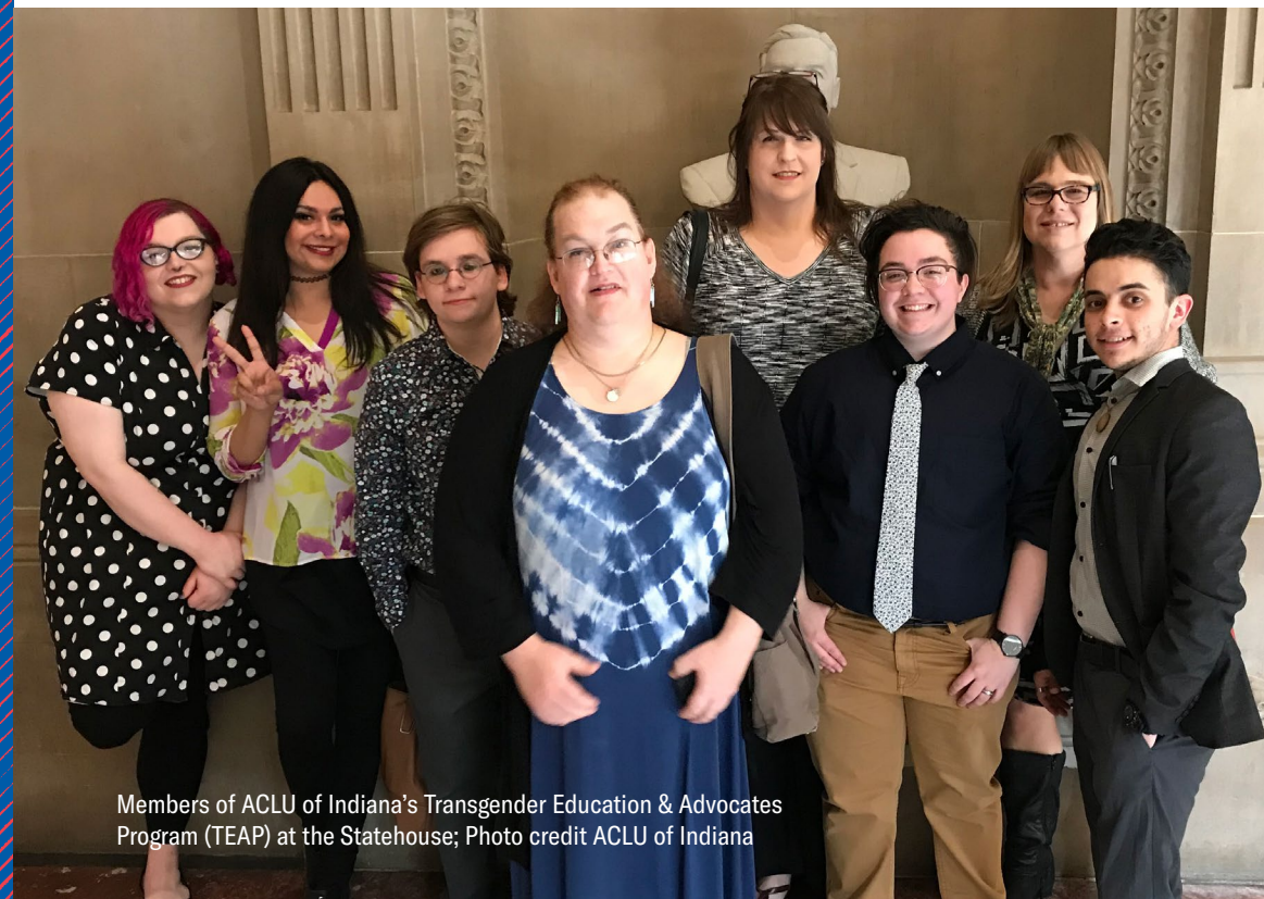
Members of ACLU of Indiana's Transgender Education & Advocates Program (TEAP) at the Statehouse

Thanks to the incredible work TEAP advocates did at the Statehouse, this dangerous legislation did not pass!