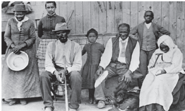
Harriet Tubman, far left, with freed slaves. Though slavery was declared unconstitutional under the 13 th Amendment, racial segregation was the norm until the Civil Rights Movement and court challenges in the mid-20 th century.

The most common constitutional violations went unchallenged because the people whose rights were most often denied were exactly the members of society who were least aware of their rights and least able to afford a lawyer. They basically had no access to the courts. More than a century would pass before the U.S. Supreme Court even had the opportunity to protect individual rights. For its first 130 years, the most notable thing about the Bill of Rights was its almost total lack of implementation by the courts.